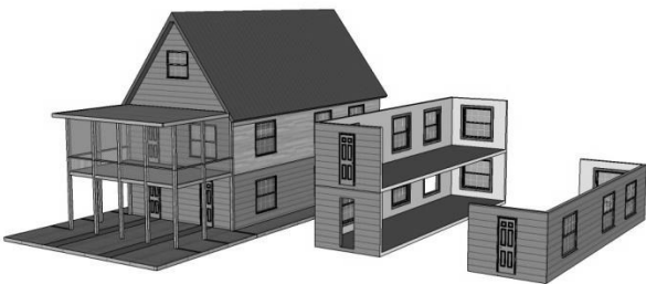
Modular (Manufactured) Home

Modular Home: a building that is manufactured in a factory as a whole or modular unit to be used as one single dwelling unit and is certified by the manufacturer that it complies with the Canadian Standards Association Standard No. CSA-A277, and is attached to a permanent foundation.