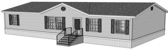
Double-Wide Mobile Home

Mobile Home: a structure that may be used as a dwelling all year round; has water faucets and shower or other bathing facilities that may be connected to a water distribution system; and has facilities for washing and a water closet or other similar facility that may be connected to a sewage system; and is certified by the manufacturer that it complies with the Canadian Standards Association Standard No. CSA-Z240 MH; and is attached to a permanent foundation.