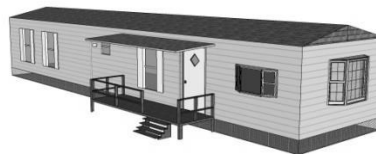
Park Model Recreational Unit

Passive Recreation Use: means a recreational land use that does not require significant development upon the site and does not lessen the natural character of the area.