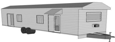
Park Model Trailer 102

Park Model Trailer/Unit: a unit designed to facilitate occasional relocation, with living quarters for a temporary or seasonal use; has water faucets and shower or other bathing facilities that may be connected to a water distribution system; and has facilities for washing and a water closet or other similar facility that may be connected to a sewage system; and it has a gross floor area not exceeding 50 m 2 (540 ft 2 ); and is certified by the manufacturer that it complies with the Canadian Standards Association Standard No. CSA-Z241.